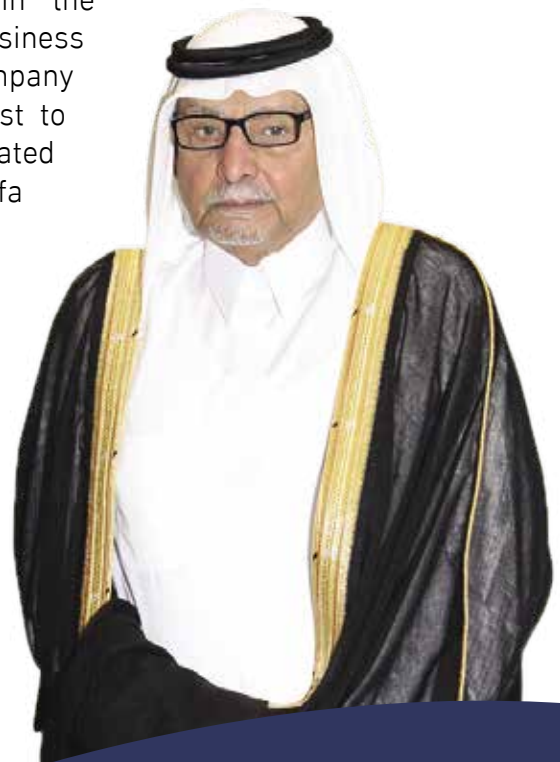
H.E. The LATE SHEIKH MOHAMED BIN HAMAD BIN ABDULLAH J. AL THANI

Sheikh Mohammed Al Thani died on Friday, Muharram 3, 1445 AH, corresponding to July 21, 2023, and the Emiri Diwan in Qatar mourned him in an official statement.